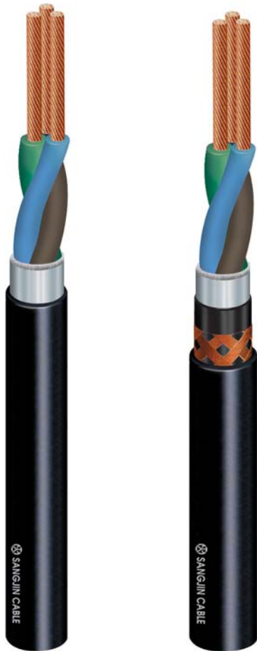
60227 KS IEC 75

300/500V 오일내성 비닐시스 (비)차폐 유연성 케이블 / 300/500V Oil-Resistant PVC Sheathed Screened and Unscreened Flexible Cables